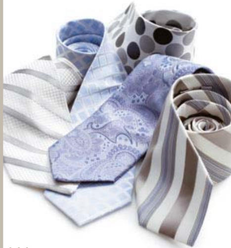
>>> Luxurious Zenetti silk ties, from $44.95*