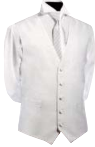
Tempo - White [302]