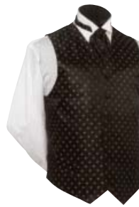
Fleur De Lys - Silver [942]