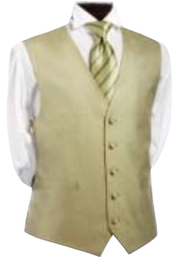
Tempo - Kiwi [306]