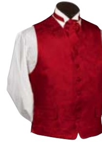
Symphony - Scarlet [929]