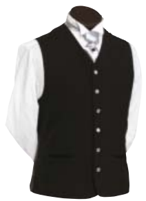
Venice - Silver Button [F02]

Satin neckwear and hanks available in these fashion colours: