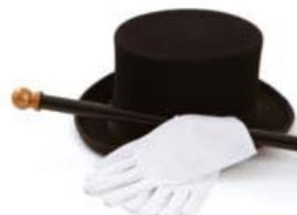
Top Hat, Cane & Gloves [sale only]

Zenetti long ties, slimboy ties and hanks available in these fashion colours: