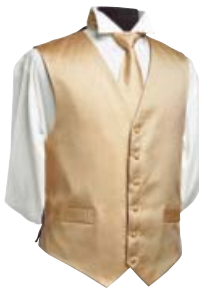
Shimmer - Champagne [009]