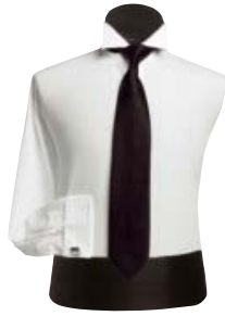
Spread Wing Collar [White 10W | Ivory 10I]