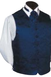
Symphony - Navy [924]