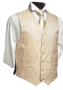
Wave - Chablis [815]