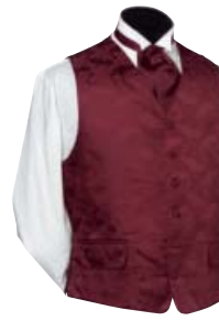
Symphony - Claret [925]