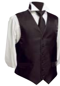
Shimmer - Black [011]