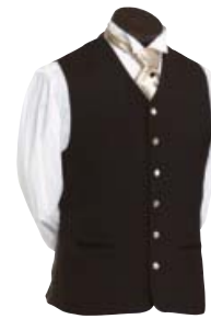
Venice - Gold Button [F01]