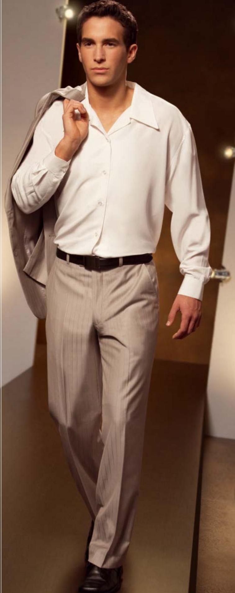
>>> Chocolate pinstripe pure wool two button suit. Accessorise with tyler shirt, paisley stripe silk long tie & hank and jake shoes.