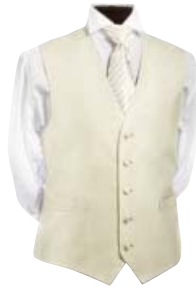
Tempo - Ivory [303]