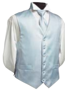
Shimmer - Pale Blue [010]