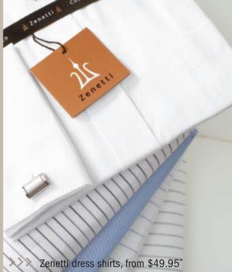
>>> Zenetti dress shirts, from $49.95*