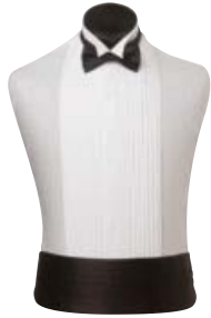
Pleated Wing Collar [White S2 | Ivory 07]