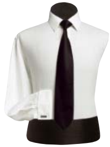
Zenetti Mark [White 19W | Ivory 19I | Black 19B]