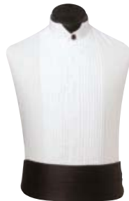
U Collar [White 04 | Ivory 09]