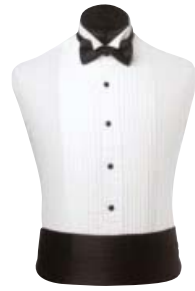
Pleated Wing Black Buttons [White S12]