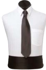
Business Collar [White S3 | Ivory S8]