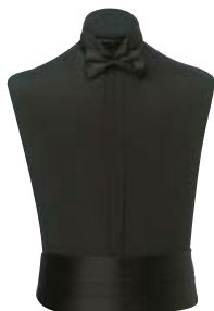
Plain Front Wing Collar [Black 18]