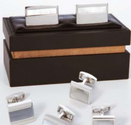
>>> Elegant cufflinks by Zenetti, boxed as perfect gifts for your groomsmen, from $39.95*