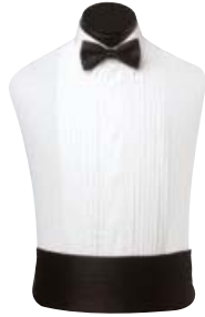
Pleated Conventional Collar [White 01 | Ivory 06]