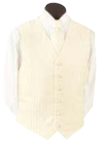
Self Stripe - Ivory [201]