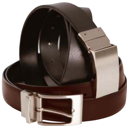
>>> Stylish Zenetti genuine leather reversible belts, from $39.95*