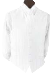
Self Stripe - White [200]