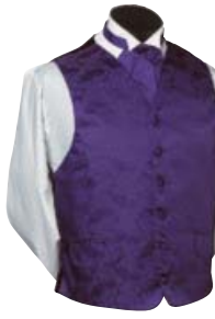
Symphony - Purple [928]