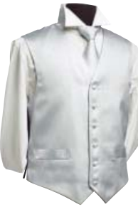
Shimmer - Silver [008]