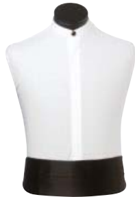
Mandarin Collar [White 13 | Ivory 14]