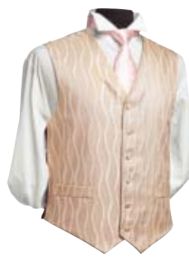
Wave - Blush [814]