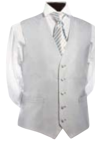
Tempo - Silver [304]