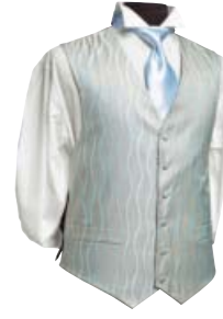
Wave - Pale Blue [816]