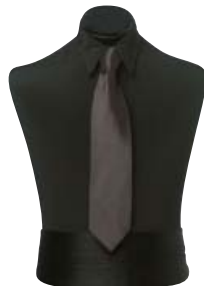
Peak Collar [Black 16]