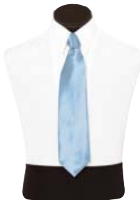
Peak Collar [White 15 | Ivory 26]