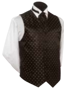
Fleur De Lys - Gold [933]