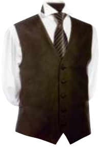
Tempo - Black [301]