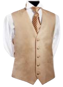
Tempo - Tan [305]