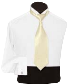
Wing Collar Double Cuff [White 42D]